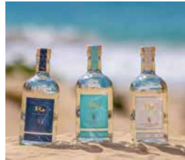
Rhum St Barth